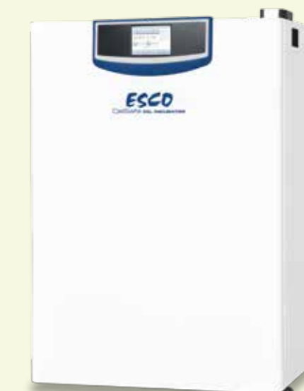
CO 2 inkubátor CLS 170