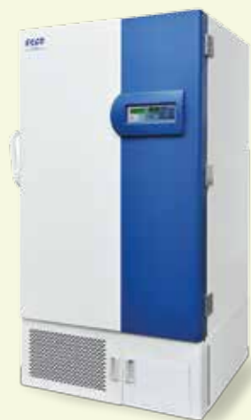
Hlbokomraziace boxy Esco Lexicon II Gold Controller 597 litrov