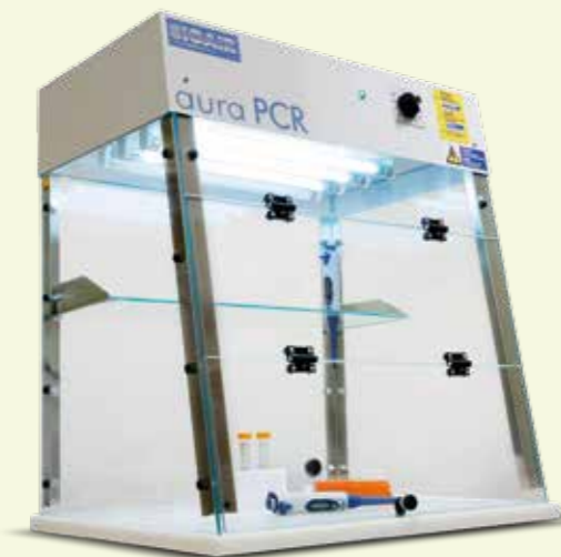
AURA PCR box