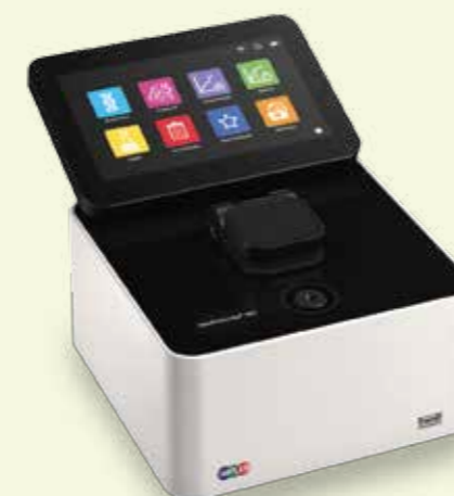
NanoPhotometer N60 Touch