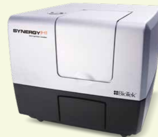
Multidetekčný reader H1M