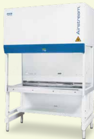
Biohazard box Airstream 1.2 m