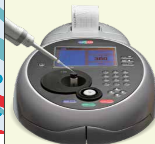
NanoPhotometer P330 "Anniversary Edition"