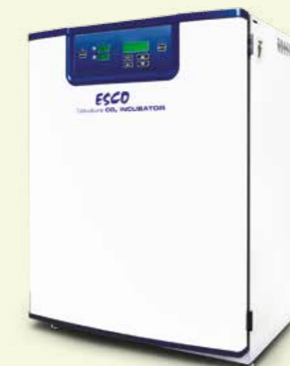
CO 2 inkubátor CelCulture 50