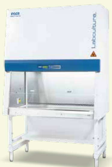
Biohazard box LabCulture 0,9 m