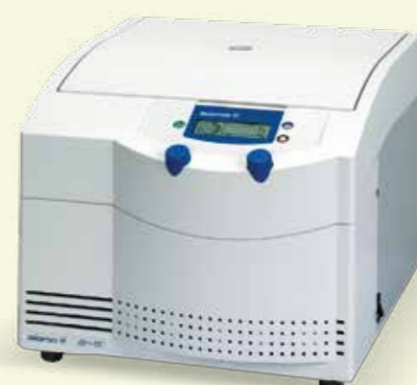
Centrifúga Sigma 2-16KL